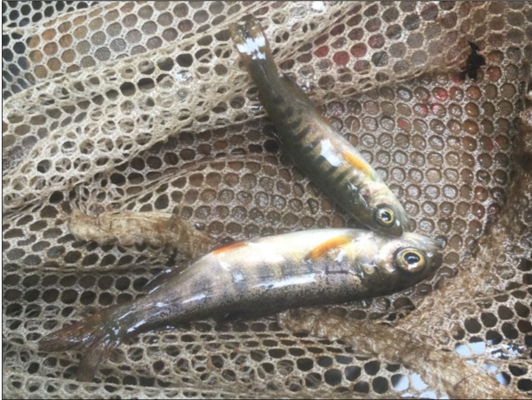
Figure 1.—Juvenile coho salmon captured at waypoint 971.