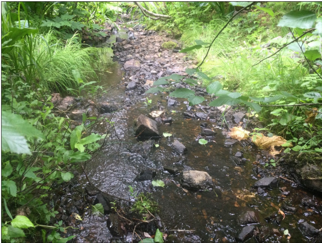
Figure 2.—Channel at old road crossing at waypoint 969.